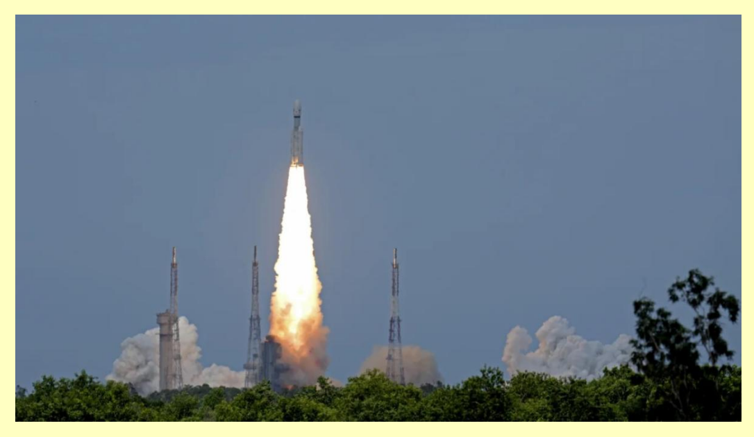
India's ambitious moon shot has entered deep space and is on its way to lunar orbit. ISRO scientists report all systems functioning normally and the landing is expected to be around Aug. 23, 2023. (Read more.)