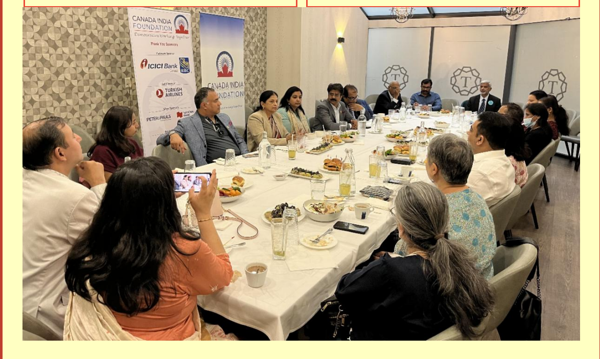
At a roundtable with Ayurveda Practitioners of Canada