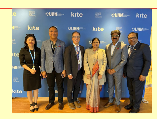
AT UHN, Toronto