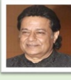
Padma Shri Anup Jalota Singer, Musician, Actor (popularly known as Bhajan Samraat) & Key Member of Tathaastu Group, India. 'Tathaastu: So Be It' is a unique source of eastern wisdom for Mind-Body-Soul