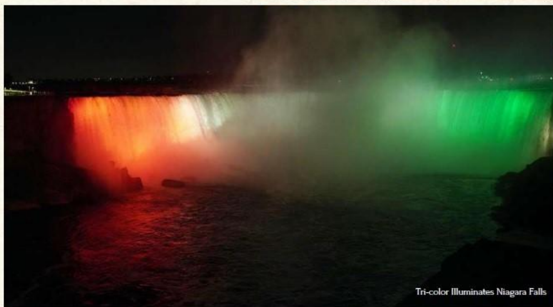
Tri-color Illuminates Niagara Falls