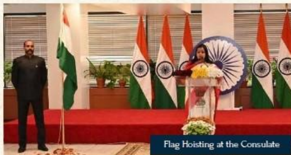
Flag Hoisting at the Consulate

A Flag hoisting ceremony was held at the Consulate premises. The event was streamed live on Facebook and Twitter for public participation.