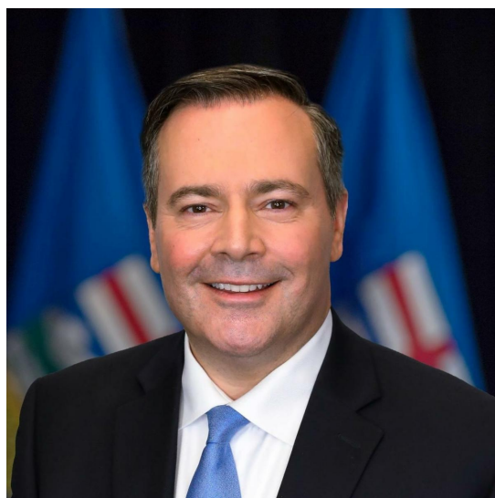
Hon. Jason Kenney