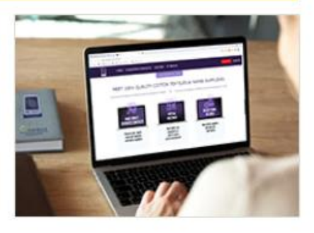
Follow simple steps, refer to Visitor's Guide ind-texpo.com/page/visitors-guide