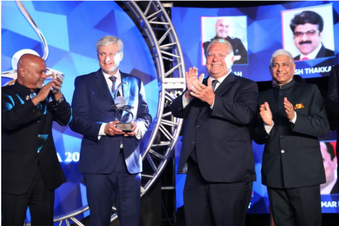
Stephen J Harper with the Global Indian Award

CIF Global Indian Award is presented annually to an outstanding person who has demonstrated global leadership, vision, and personal excellence.