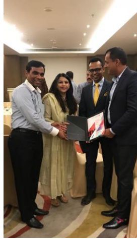
With ICBC team