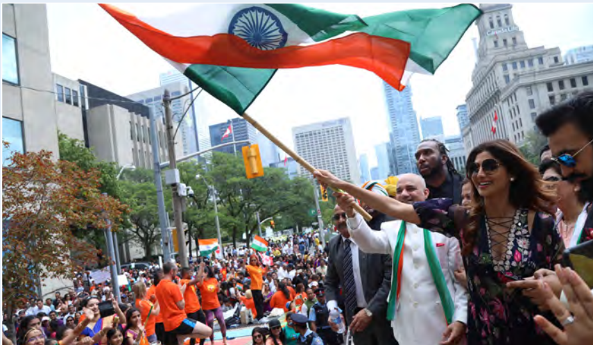
The Parade was marshalled by Bollywood star and yoga enthusiast Shilpa Shetty.

Panorama India, with the support of Consulate General of India, Toronto celebrated India's 70th anniversary of Independence Day – India@70 & Grand Parade on