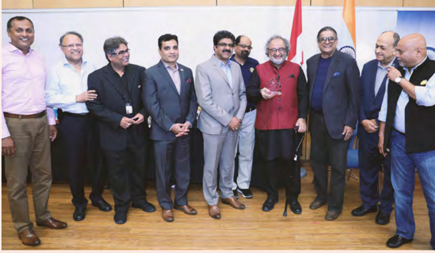
The 3rd lecture in CIF Speaker Series was held at Sheridan College, Mississauga on August 10. Seen here is the speaker Mr. Tarek Fatah with CIF Board Members

Canada India Foundation, as part of its ongoing speaker series, hosted a lecture with well-known Columnist, author and broadcaster Mr. Tarek Fatah. The lecture, originally planned at Ryerson University Campus had to be rescheduled as Ryerson cancelled the speech with no reasons provided and was eventually held on the same day (August 10) at Sheridan College in Mississauga.