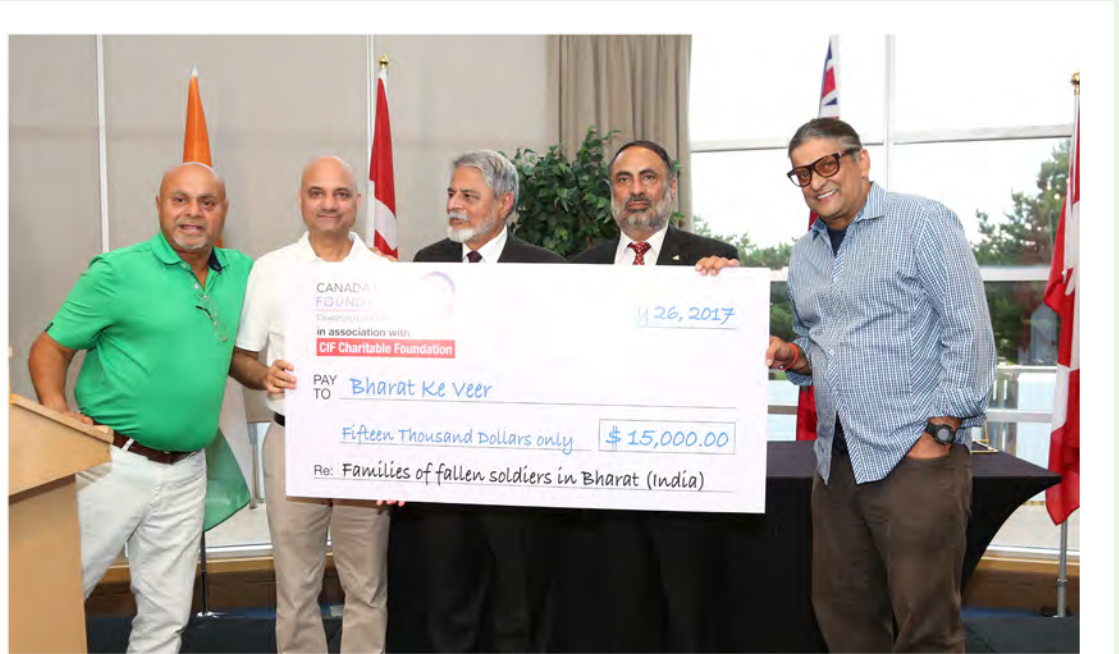
2 nd Annual CIF Charity Golf Tournament raised $ 20,000 for families of fallen soldiers in India. The money will be donated through website "Bharat ke Veer", managed by Ministry of Home Affairs, India.