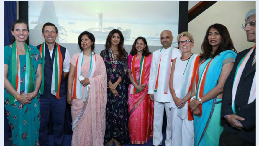
Premier, Leader of Opposition, MPs, MPPs and Provincial as well as federal ministers participated enthusiastically at this year's event.

Canada India Foundation also had a booth at this year's event. Hundreds of people visited the CIF booth and learned firsthand about the work CIF is doing as well as about our outreach efforts.